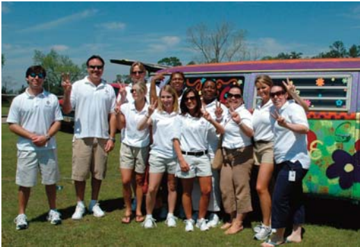
JDCC Nursing students pose in front of the JDCC "Peace, Love, and a Cure" van as they get ready to walk!