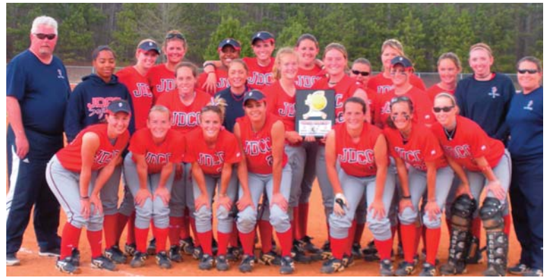
The JDCC Lady Warhawks and their coaches proudly display their First place trophy from the Hanceville Tournament.

Saturday's games were canceled due to rain. Next, the ladies traveled to Andalusia to play a double header against LBW on the 19th. They won the first game 4 to 0, but lost the second 4 to 2. Two days later, the team faced Enterprise-Ozark CC in Enterprise. The girls played tough into extra innings, but lost 1 to 0. However, this did not stop the Lady Warhawks from scoring several runs in the first inning of the next game. They ended the double header against Enterprise with a 6 to 1 win. The softball team's next home game will be April 13th at 1:00 and 3:00 against Wallace State Dothan. Come out and support your Lady Warhawks!