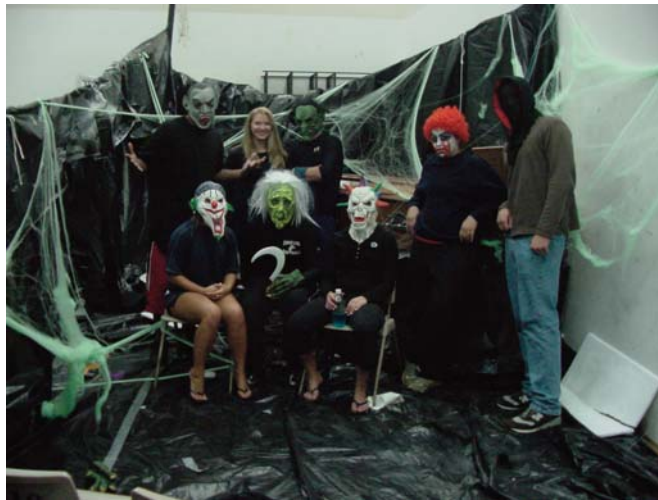
JDCC SGA volunteers pose before beginning a night of fright

The JDCC Student Government Association has been busy planning and implementing activities for Fall Semester 2007. One of the October events was a voter registration drive held during the 2007 College Fair on October 17. During the fair, SGA members registered 21 students to vote; they also informed visitors of student leadership opportunities in the SGA and advertised the 2007 Haunted House fund raising event scheduled for October 30 and 31. The Haunted House was quite successful, with well over 200 hundred visitors. We had a great turn out, and we even scared a few people! I'm sure everyone would join me in saying thanks to the volunteers. In other SGA